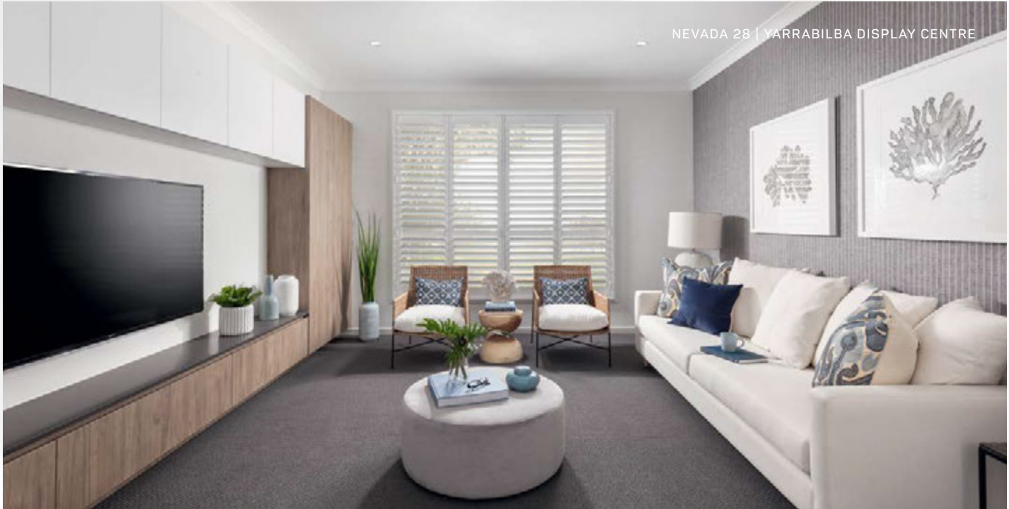
NEVADA 28 | YARRABILBA DISPLAY CENTRE

Photography depicts items such as floor coverings, light fittings and ceiling height adjustments which are not included in the price of your home with standard or Classic Style Inclusions or which are not supplied by Domaine Homes such as decorator items.