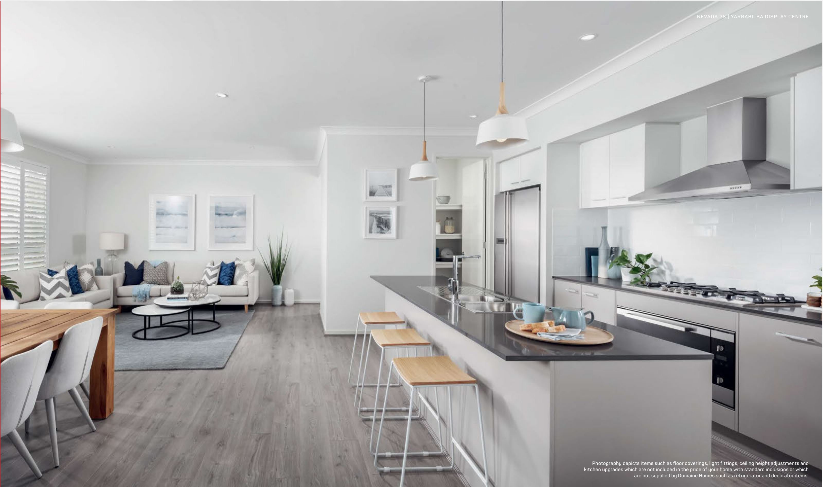
NEVADA 28 | YARRABILBA DISPLAY CENTRE